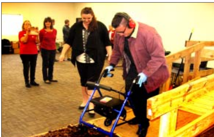
Using a walker in different conditions.