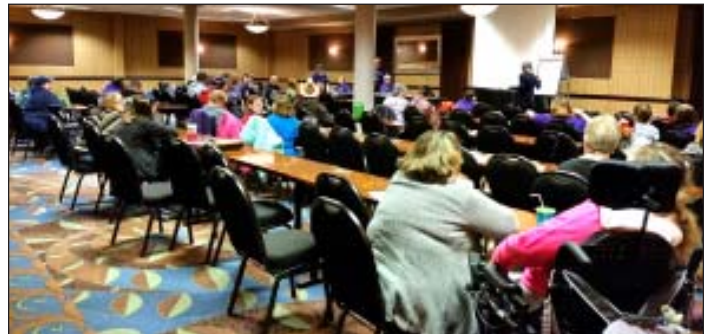
Session attendees enjoy the presentations.