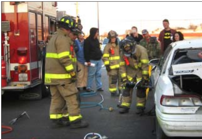
First responders for an automobile accident.

JACIL recently co-sponsored an interactive disability awareness event designed to help first responders understand the needs of people with various disabilities in emergency situations. Here are a few photos from that event.