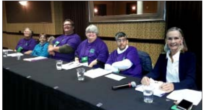
Some of our Speak Up Speak Out presenters.

The People First Aktion Club's co-sponsors are JACIL and the Kiwanis Club of Jacksonville and Friends Helping Friends co-sponsors are JACIL and Washington Place Group Home in Beardstown.