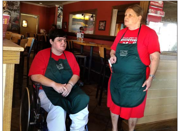
Greeters were on hand to welcome the next set of customers arriving for the event.