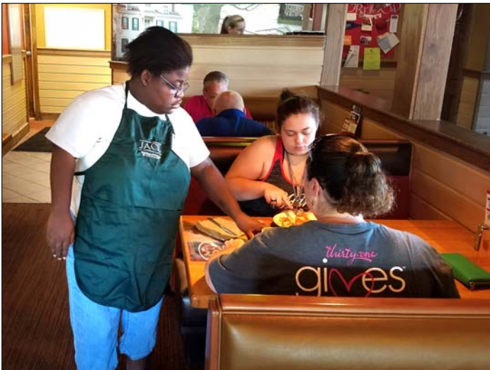
One of the servers chats with a couple of early-bird customers.