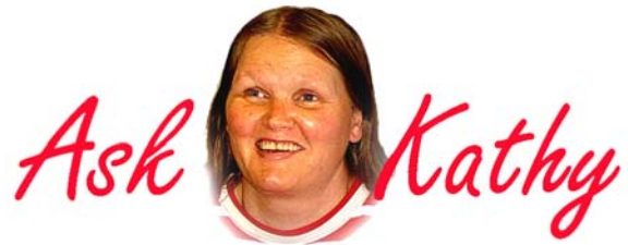
by Kathy Price

The course is designed for teens and adults. The fee for the eight-class session is $60.00 and includes the student workbook/DVD. The cost for two people from the same family is $100.00. Preregistration is required and class size is limited. Please call JACIL at 217-245-8371 for more information.